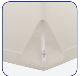
Patented in-cartridge metering for precision accuracy.