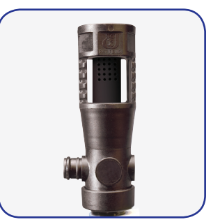
SafeGap<sup>TM/MC</sup> and Air Gap eductors meet ASSE 1055B standard for back flow prevention and are reliable.*