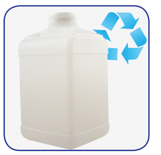
100% Recyclable Packaging