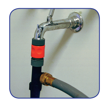
Filter valve unit enables easy water hookup and filters unwanted sediment.